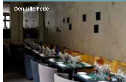
Den Lille Fede