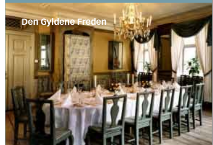
Den Gyldene Freden